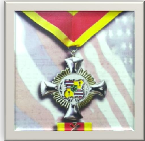
Hawaii Medal of Honor