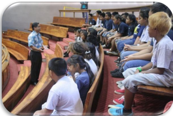
Rep. Aquino answering questions and sharing information & facts about the legislative process.