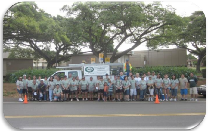
HGEA Graffiti Clean-Up Crew