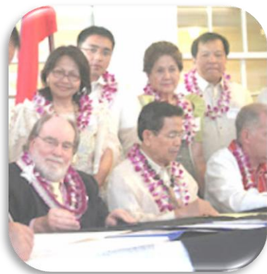
Gov. Abercrombie, and the LCP mayoral delegation signing the Memorandum of Understanding.

The State of Hawaii shares common goals with the Philippines in fostering strong and effective local governments, promoting and maintaining friendships, as well as learning and sharing social and economic opportunities that benefit cities in the Philippines and Hawaii.