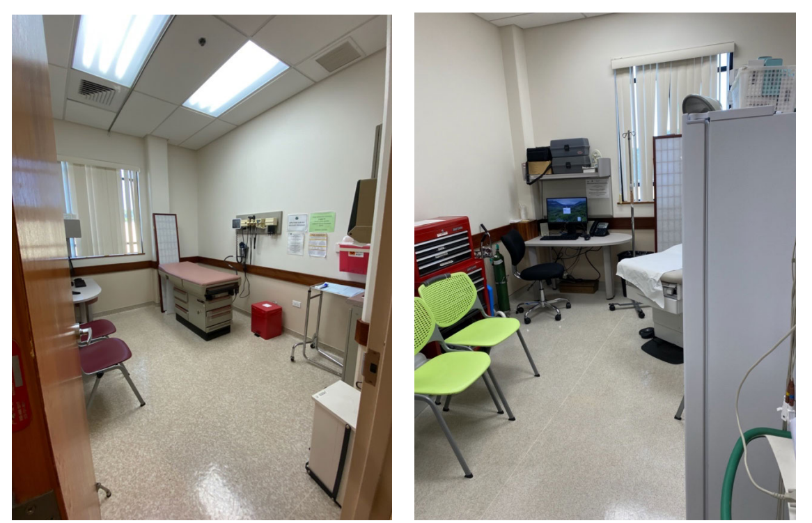
Judd examination rooms. Desks and chairs are too low for providers; computers are old; storage is limited; walls are drab and lack art.

2. To update furniture and cabinetry in the clinical areas, including ten examination rooms, so that providers and patients are accommodated safely during medical appointments and procedures. See photos below: