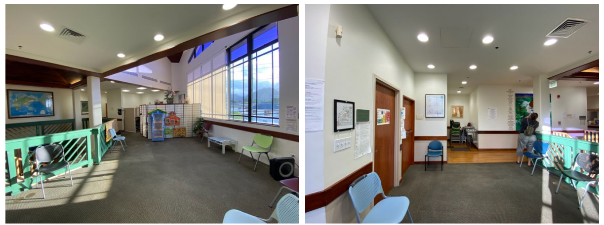
Judd Medical Clinic patient waiting area. Note the cold and worn carpeting. Furniture is minimal and uncomfortable. The secondary waiting area also lacks furniture and is unwelcoming.

2. To update furniture and cabinetry in the clinical areas, including ten examination rooms, so that providers and patients are accommodated safely during medical appointments and procedures. See photos below: