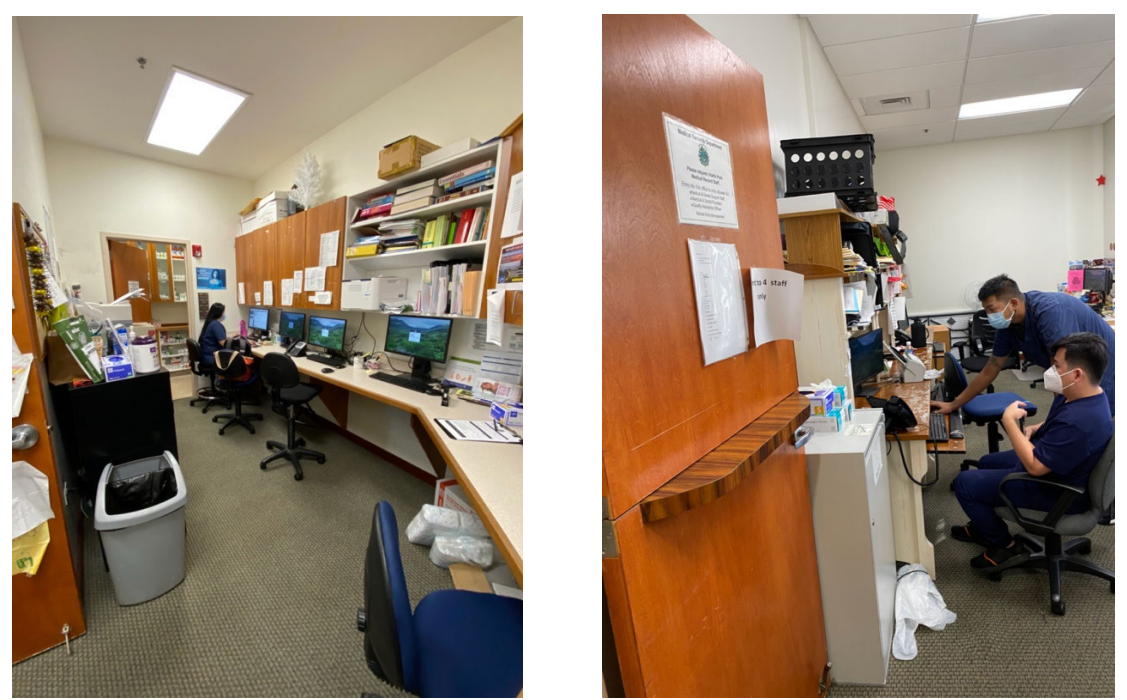
Provider work areas in Judd Clinic. Rooms are crowded with insufficient privacy and storage.

3. To reconfigure staff work areas to allow more people to work comfortably, as well as to enhance privacy for confidential discussions.