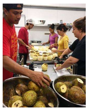
15 Manufacturing Jobs Created