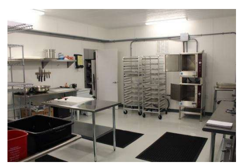
HUPC Commercial Kitchen

With support from requested state GIA funds currently proposed as well as through an investment of earned revenues, the co-op is now working to develop an outdoor fruit intake area with enclosed chill and dry storage in FY 2023. All planning and design for this capital upgrade has been completed and permits are now being received in partnership with DOA. This FSMA-compliant receiving station will significantly increase the volume of fresh fruit the co-op is able to accept at a time and provide appropriate storage facilities to ensure that fruit quality and food safety are maintained.