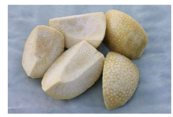
Minimally Processed 'Ulu Quarters

secured a 25-year commercial lease over the Honalo Marshaling Yard (valid through 2043). Coop managers have been directly responsible for coordinating design, construction and permitting of a 300+ square foot commercial kitchen, successfully completing FSMA training and certification, developing a FSMA-compliant food safety plan, creating an in-house food safety training program for employees and 20 food manufacturing related jobs, acquiring over 400 customers throughout Hawai'i including schools and hospitals, and working with manufacturing consultants to develop a phased infrastructure