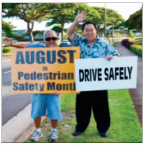
Celebrating Pedestrian Safety Month in Waikele.

Supports Hawaii's business economy by providing $6 Million in funding to the Hawaii Strategic Development Corporation for the Hawaii Growth Initiative, an investment program designed to develop, stimulate, and support an ecosystem of high-growth entrepreneurial businesses in Hawaii.