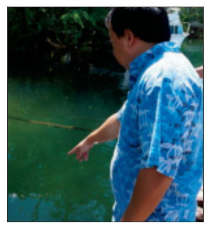
Leading an investigative site visit touring Honolulu Harbor to address the Molasses environmental disaster.