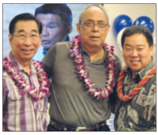
Celebrating the first anniversary of Hawaii's reinstated Organ Transplant Center.