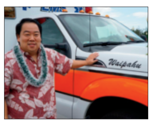
Blessing Waipahu's newest ambulance.

I look forward to the grand opening of our newly rebuilt regional medical center. Because of the fast growing population in the leeward area, I am thankful for the addition of QMC West Oahu as an alternative to further make emergency medical services closer to our residents here in Central Oahu.