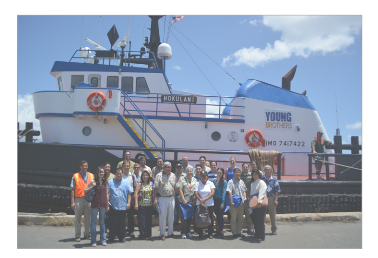
At Honolulu Harbor, before the Hokulani.