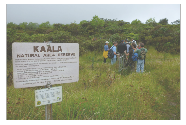
Kaala Natural Area Reserve. (July 19, 2013.)

Several members of the House Finance Committee and staff of the Department of Land and Natural Resources (DLNR) participated in a visit to Mount Kaala Natural Area Reserve, which consists of 1,100 acres of dryland to wet shrub forest. In 2012, most of the activity in the area has involved maintaining fences and the lower Kaala access road, monitoring hoofed animal activity and conducting control when necessary, and completing the remaining portion of the boardwalk replacement project in collaboration with partners. Weed control is currently focused at the summit bog where it is native dominated. As part of the Natural Area Reserves System (NARS) rare plant program, staff monitored and surveyed plants in the lower western portion of the Natural Area Reserve indentifying threatened and endangered species occurring in that area. NARS staff also coordinates DLNR's watershed initiative, which is aimed at working to ensure fresh water is available for the people of Hawaii in perpetuity by protecting our watershed forests.