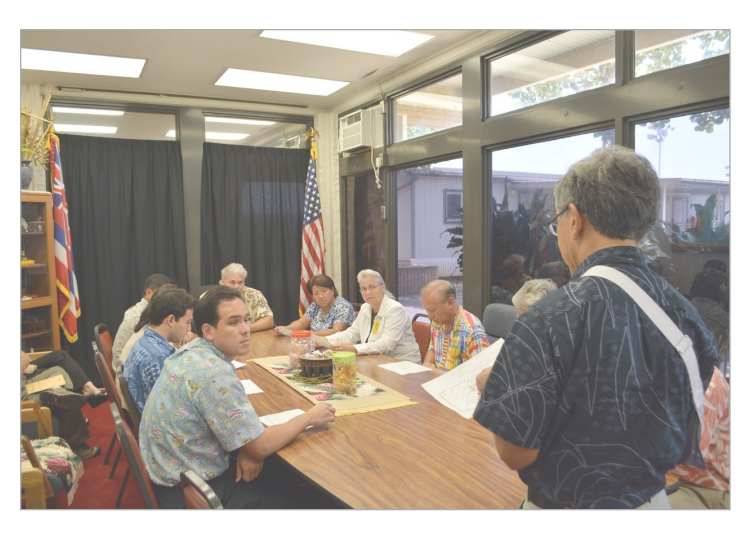
The House Finance Committee were briefed before a tour of OCCC.