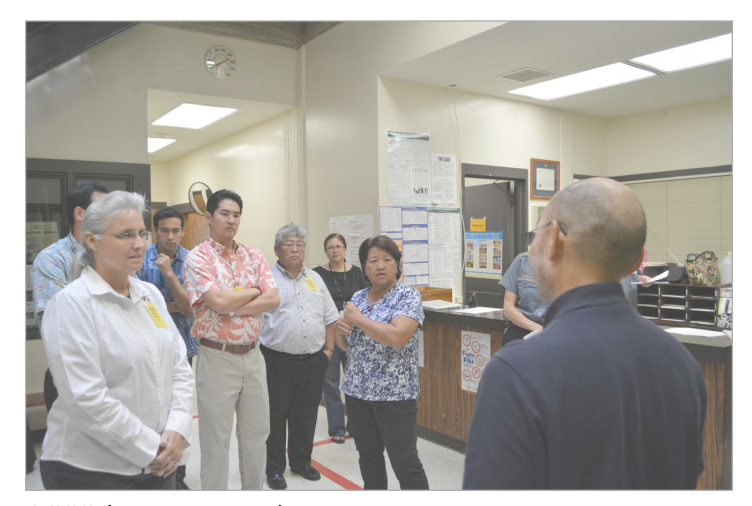
OCCC. (August 20, 2013.)

On August 23, the House Finance Committee visited the State Archives and viewed rare items including a Hawaiian petition, coin mints, Hawaiian Kingdom Official's uniform, and a signed 1852 Treaty with Great Britain including the attached seal. The Committee also viewed the renovation project at the Kamamalu Building in downtown Honolulu. The final site visit in August was to Honolulu Harbor. The tour started on the road at Pier 1, continued to Sand Island, and concluded with a Tug Boat tour. The House Finance Committee will continue conducting site visits statewide over the next few months.