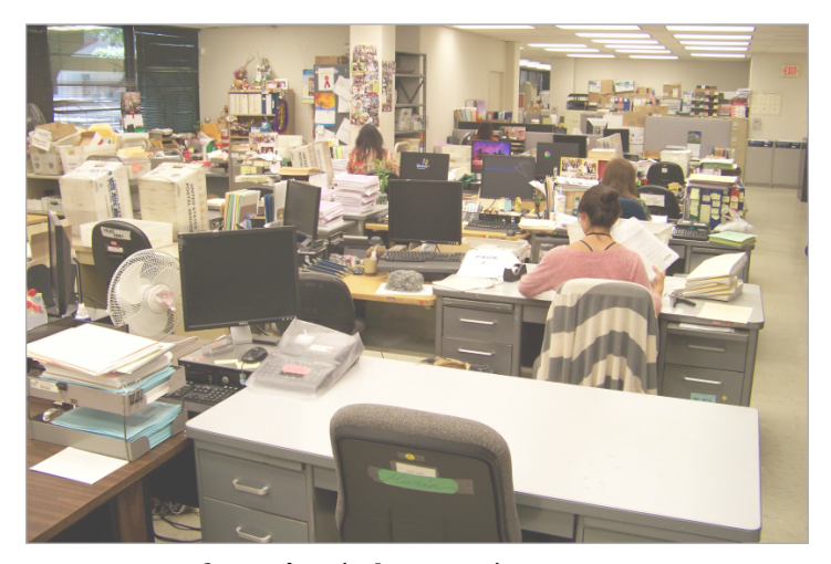
Department of Taxation. (July 17, 2013.)

visit on August 20 to the Federal Detention Center and the Oahu Community Correctional Center (OCCC). The stark comparison between these two facilities evidences how much attention is needed to improve the State's corrections facilities.