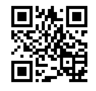
Sign up for e-mail updates http://goo.gl/7g1zp