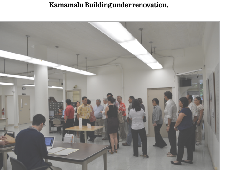
Inside the Hawaii State Archives Building.