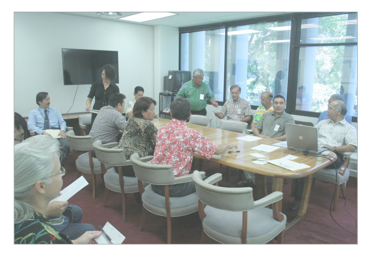
The House Finance Committee in a conference room at DOTAX.