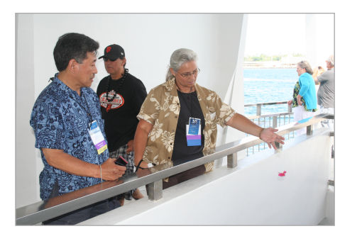
Visiting the Arizona memorial.

economic development from the East-West Center. We were provided with the opportunity to interact with these experts on bigpicture economic trends in the Pacific region as well as learn some specific impacts on state and regional economies as Hawaii pre-