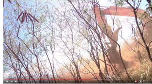
The Taking of Hanalei Gulch / Puna County

https://www.youtube.com/watch?v=QoE1bdaqUvg