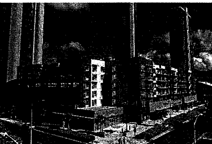
400 Keawe Place

Designed a new 4-span 120-foot long precast-prestressed concrete slab bridge to replace the existing bridge that was damaged by heavy rains.