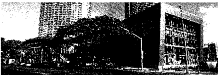
Honolulu Design Center

A $50 million addition and renovation of an existing twelve-story, 63,447 square foot hotel into a luxury hotel. The project includes converting eight hotel rooms per floor to a single unit that occupies the entire floor, creating a total of only nine suites for the entire hotel.