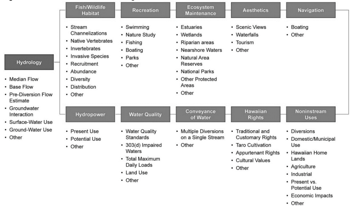
Figure 1-1. Information to consider in setting measurable instream flow standards.

The Hawaii Supreme Court, upon reviewing the Waiahole Ditch Contested Case Decision and Order, held that such "status quo" interim IFS were not adequate to protect streams and required the Commission to take immediate steps to assess stream flow characteristics and develop quantitative interim IFS for affected Windward Oahu streams, as well as other streams statewide. The Hawaii Supreme Court also emphasized that "instream flow standards serve as the primary mechanism by which the Commission is to discharge its duty to protect and promote the entire range of public trust purposes dependent upon instream flows."