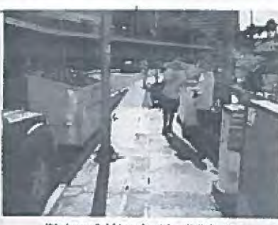
pulled 4 tons of track from Ale Wai bestop PARTOE COURTERY PRANE BUILD

The retired longshoreman "I saw plantic bags in the