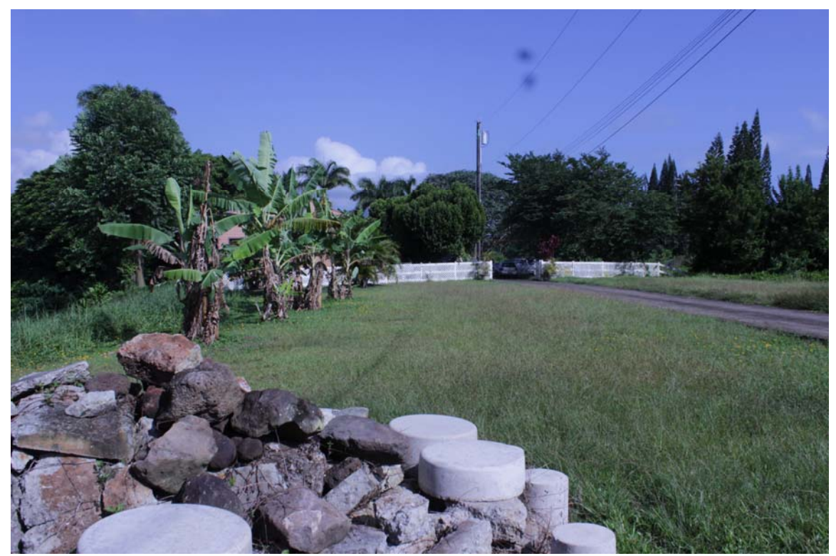
Photo 3- Some residential lots are adjacent to the future farming operations of "homestead" type cooperators