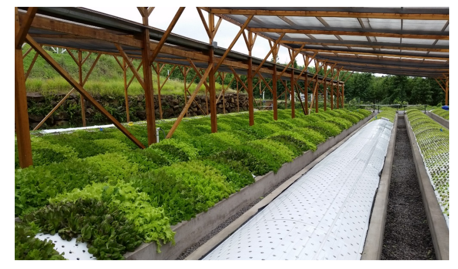
Figure 8: Kula Makai Farm setup

After a lunch at the Ulupalakua Ranch Store, we continued to our last farm visit at the Kula Makai Farm. The Kula Makai Farm is an aeroponic farm that grows a variety greens. This is the first aeroponic farm or operation that I have seen. The operation is like hydroponics except that the roots of the plants do not sit in water, they are suspended in air and the nutrient rich water is sprayed constantly on the roots. The water is then recaptured and recycled into the system. The "beds" that the greens grow