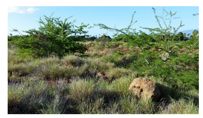
Figure 4: Buffel grass and Opiuma trees in trough

The Conservation Specialists also joined Wes Nohara for the Lahaina Temporary Flood Control annual inspection. This inspection was especially important because it was Wes' last, so we will now be conducting the inspection. It was important to learn what maintenance needs to be done, and how structural integrity of the berms, troughs, and drainage ways can be improved. Grubbing of vegetation in diversion troughs, and repairing berms damaged from human activities were the main concerns. We also went to inspect access roads on the Kamehameha Schools Kuia lands, as there were reports of erosion issues. These access roads were put in by the State for fire protection, but were completed in a manner that did not account for drainage and erosion. The roads were cut straight up and down, and have neglected the use of existing diversions to drain water into the gulches. There were large rills along the sides of the road, and many exposed rocks where soil had eroded away. Fixing these roads will be very expensive, but a collaborative effort between landowners and stakeholders will hopefully allow these concerns to be addressed.