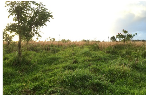
Figure 2. Photo of Haiku pasture taken while conducting vegetation inventory

This quarter was heavily focused on conservation planning due to the NRCS 2016 Farm Bill Programs sign ups. The SWCD Conservation Specialists have been assisting applicants with eligibility and planning due to the fact that Kahului's NRCS office is understaffed. My work this quarter in conservation planning has been largely focused on planning and gathering necessary eligibility documents for clients interested in applying for Farm Bill programs.