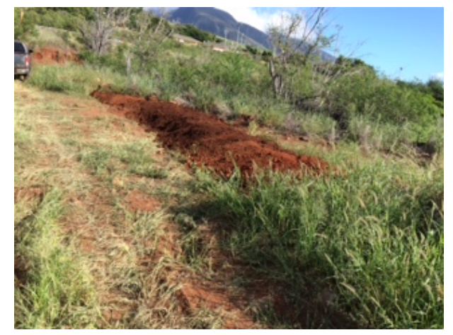
Figure 3: The reconstructed berm from the Lahainaluna Diversion

On December 16<sup>th</sup>, Wes Nohara, Kylie Wong and I conducted the annual inspection of the Lahaina Temporary Flood Control Project. The system consists of an earthen berm and trough and