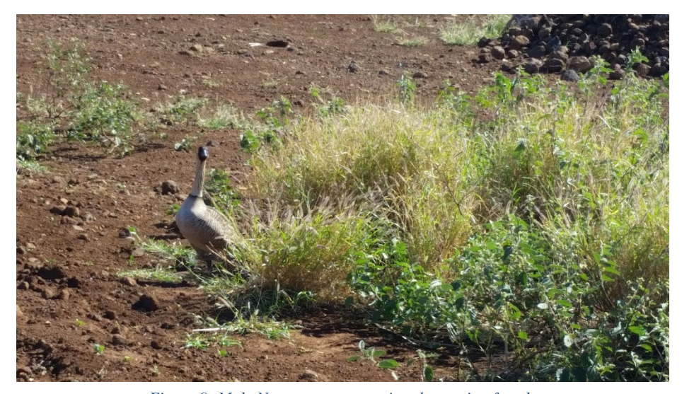
Figure 9: Male Nene goose protecting the nesting female

As discussed in previous quarterly reports, there is a cooperator in the Launiupoko area that is drastically behind schedule according to the conservation plan. Since the April 27<sup>th</sup>, 2015 site visit, three structures have begun construction on site. One structure is the main dwelling, another is a second dwelling, and another is a detached garage. There has also been very little done in terms of completing the conservation plan, one of the two vegetative barriers were installed since April 27<sup>th</sup>. This leaves me to believe that the cooperators priority is focused on the house construction rather than the conservation plan. The West Maui SWCD board wrote a letter to the cooperator informing them that the Vegetative Barrier and Herbaceous Wind Barrier practices must be implemented by the end of December, 2015 in order for the conservation plan to not be canceled. This is a concern for the cooperator because of the circumstances that the conservation plan was developed. The cooperator cleared the entire 15 acre property