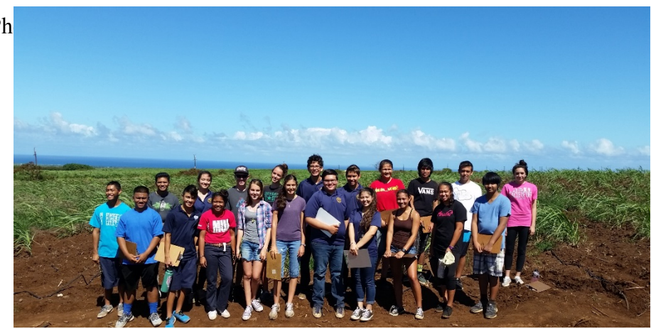
Figure 1: Participants of the 2015 CAP Land Judging Contest

This quarter the Maui SWCDs hosted the Conservation Awareness Program Land Judging Contest for high school students to participate in. There was a lot of preparation that was required to ensure the participants were well prepared for the contest, as well as setting up the contest site and the contest itself. Prior to the contest, Kylie Wong and I conducted a total of 10 training sessions and mock contests at 3 different high schools and for 1 home school. We tried to contact other high schools to train at but received no response. There was also one contest planning meeting and one train the trainer session. It is my hopes that more high schools will utilize our