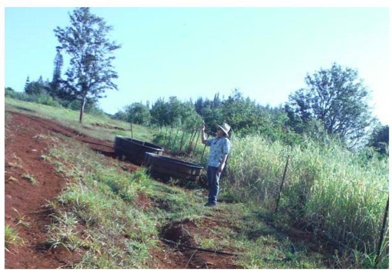
Recording a GPS point to cite the over-used trough and highly eroded pasture location. Sparse groundcover, overgrazing, and consistent animal traffic have caused gullies to form in the soil.

Upon joining the Lihue NRCS SWCD office, I was immediately able to offer my GPS and GIS skills and knowledge in the field. Despite not having computer access, I filled a niche that was previously not occupied by a designated employee. My experience with Garmin technology and photography documentation in the context