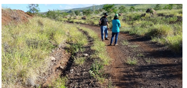
Figure 4: Wes and Kylie in a trough discussing proper design

On December 10<sup>th</sup>, I met with Wes Nohara at the Lahainaluna Diversion for documentation and maintenance purposes. During one of Wes' annual inspections he discovered that there were dirt mounds that were built in the trough of the diversion. These dirt mounds, commonly called "whoops", are used by bicyclists as ramps for fun. These whoops were probably built by kids that have no idea about the importance of keeping the diversion clear of all obstacles. Wes wanted documentation of the obstacles and also of a portion of the berm that was damaged. After documenting the condition of the diversion, Wes and I began moving the dirt from the whoops to the damaged portion of the berm. The obstacles were removed and the berm was repaired with the available material. The work done by Wes and I was recorded and submitted to the responsible land owner.