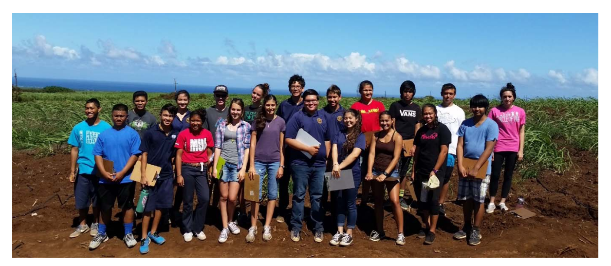
Figure 3. Student participants at the 2015 CAP Contest

There were 25 students from five schools that participated this year. The Soil Seekers, a home school student group, placed third. This was exciting as this was their first time participating in the CAP contest. Kamehameha Schools placed first, and St. Anthony second.