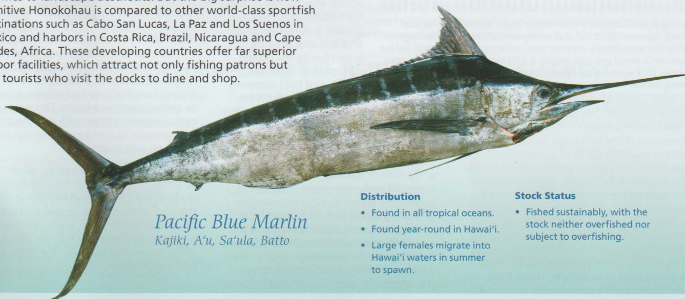
Pacific Blue Marlin Kajiki, A'u, Sa'ula, Batto

Ko'olina, a private facility on O'ahu, comes close to being a first-class harbor in Hawai'i. Perhaps the best future for Honokohau is to become privatized as well. Kona and its surrounds continue to grow. Part of that growth could be the redevelopment of Honokohau into a world-class marina that attracts other businesses and volumes of tourists above and beyond the sportfish fraternity. ➡