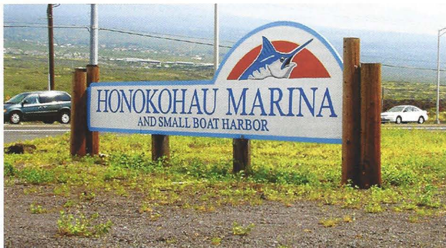
Honokohau could be redeveloped into a world-class marina that attracts businesses and volumes of tourists.