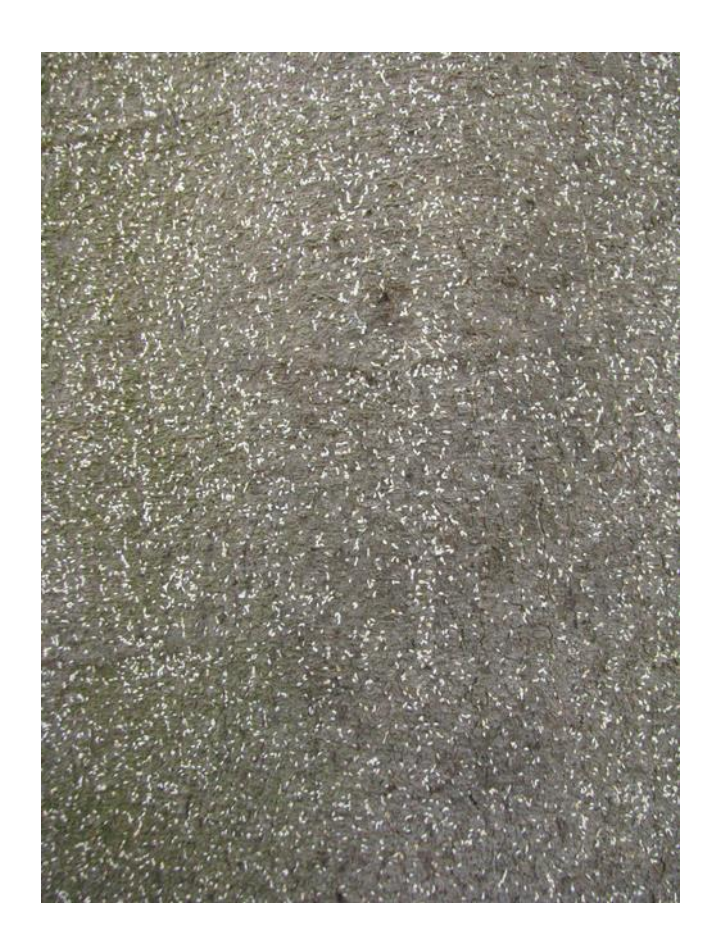
MFC on trunk of infested tree