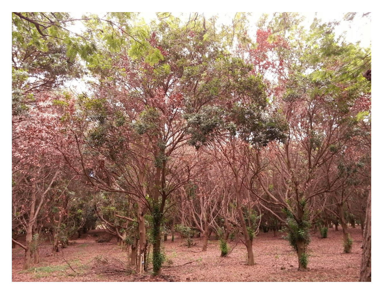
Extensive MFC damage within an orchard block