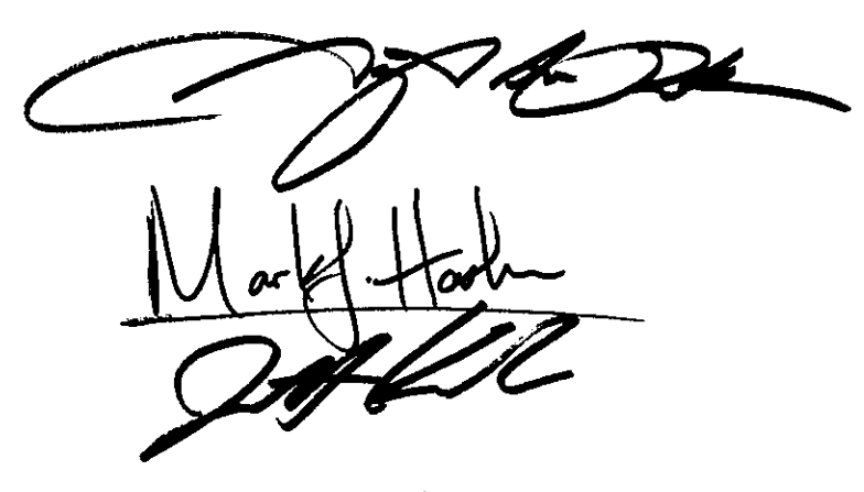
JAN 2 8 2015