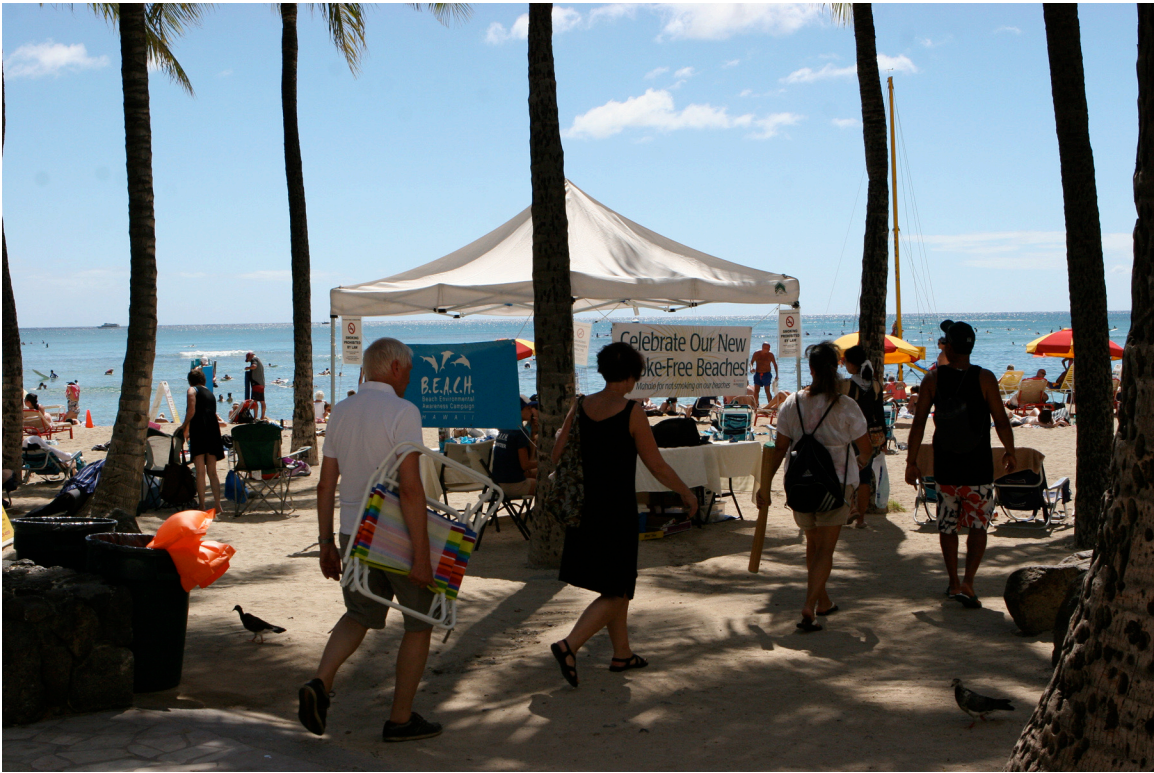
B.E.A.C.H. outreach at Kuhio Beach, Waikiki, September, 2013 - educating the public about the new smoke-free beaches (Waikiki, Ala Moana and Sandy Beach became smoke-free in 2013) and the upcoming island-wide ban which started in January 2014.