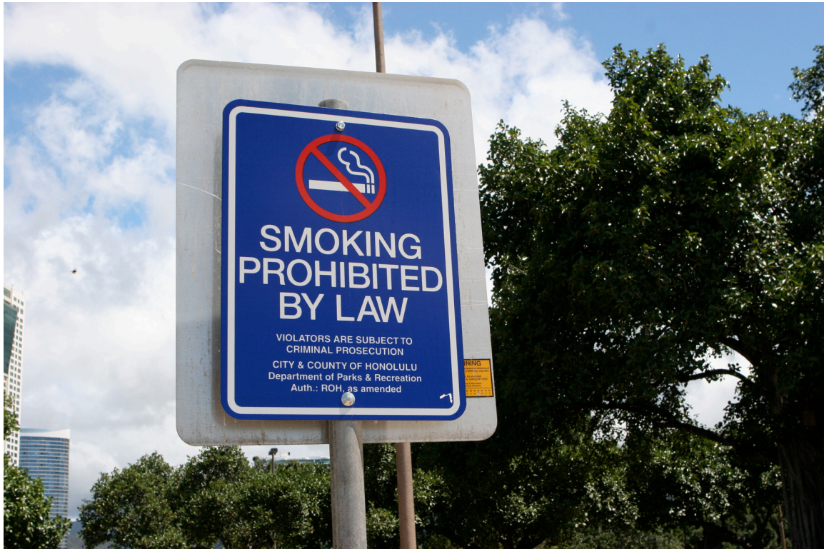
Signs were placed at the entrances to parks to ensure that everyone sees them as they enter the park. The smoke-free symbol (which is internationally recognized) is necessary to ensure that non-english speaking people are aware of the new law.