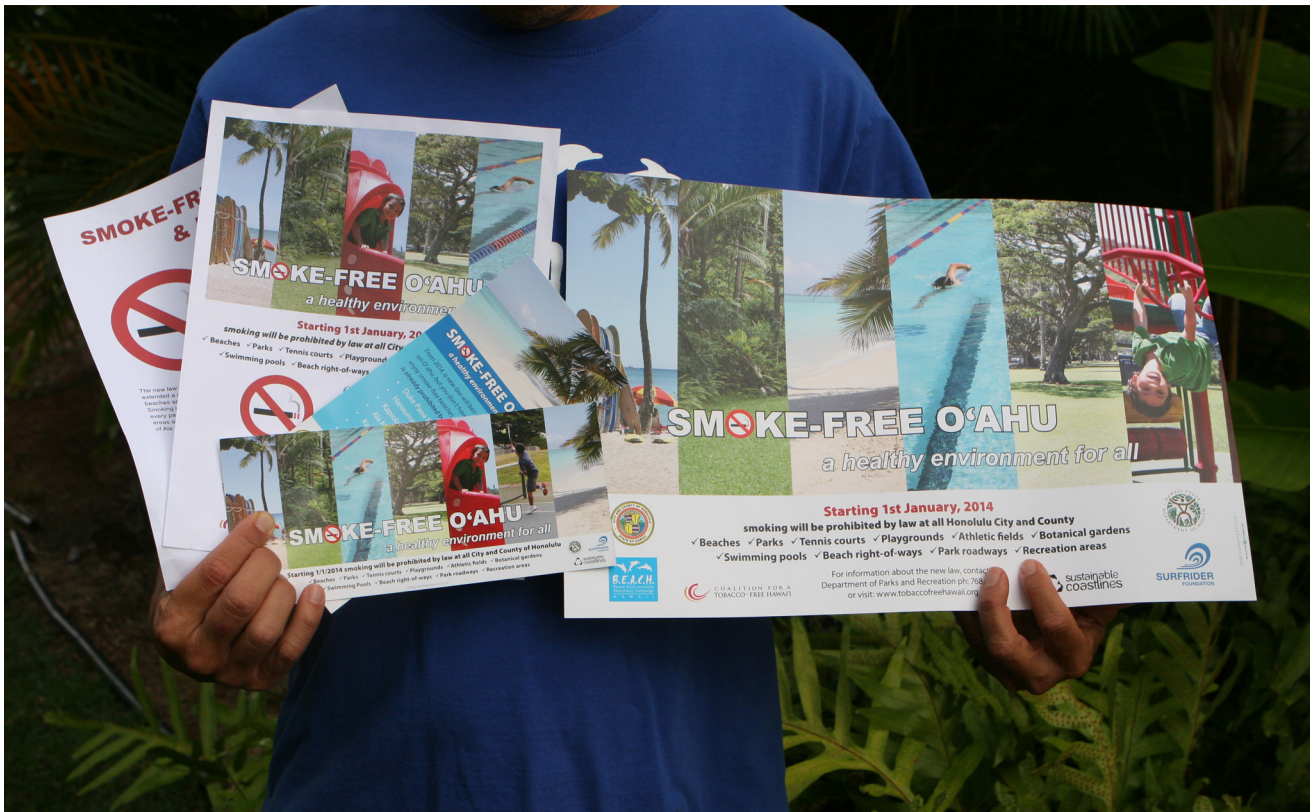
Smoke-free beaches and parks educational materials from L: permit flyer for groups, printable flyer (available on B.E.A.C.H. website), rack cards, poster. All materials designed by B.E.A.C.H.