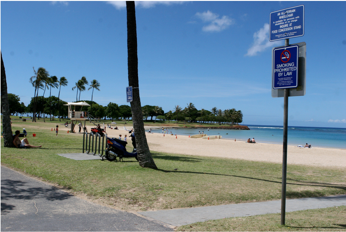
City and County of Honolulu signs were placed on existing sign poles often on the back of other signs or on buildings or other structures so no new poles were needed.