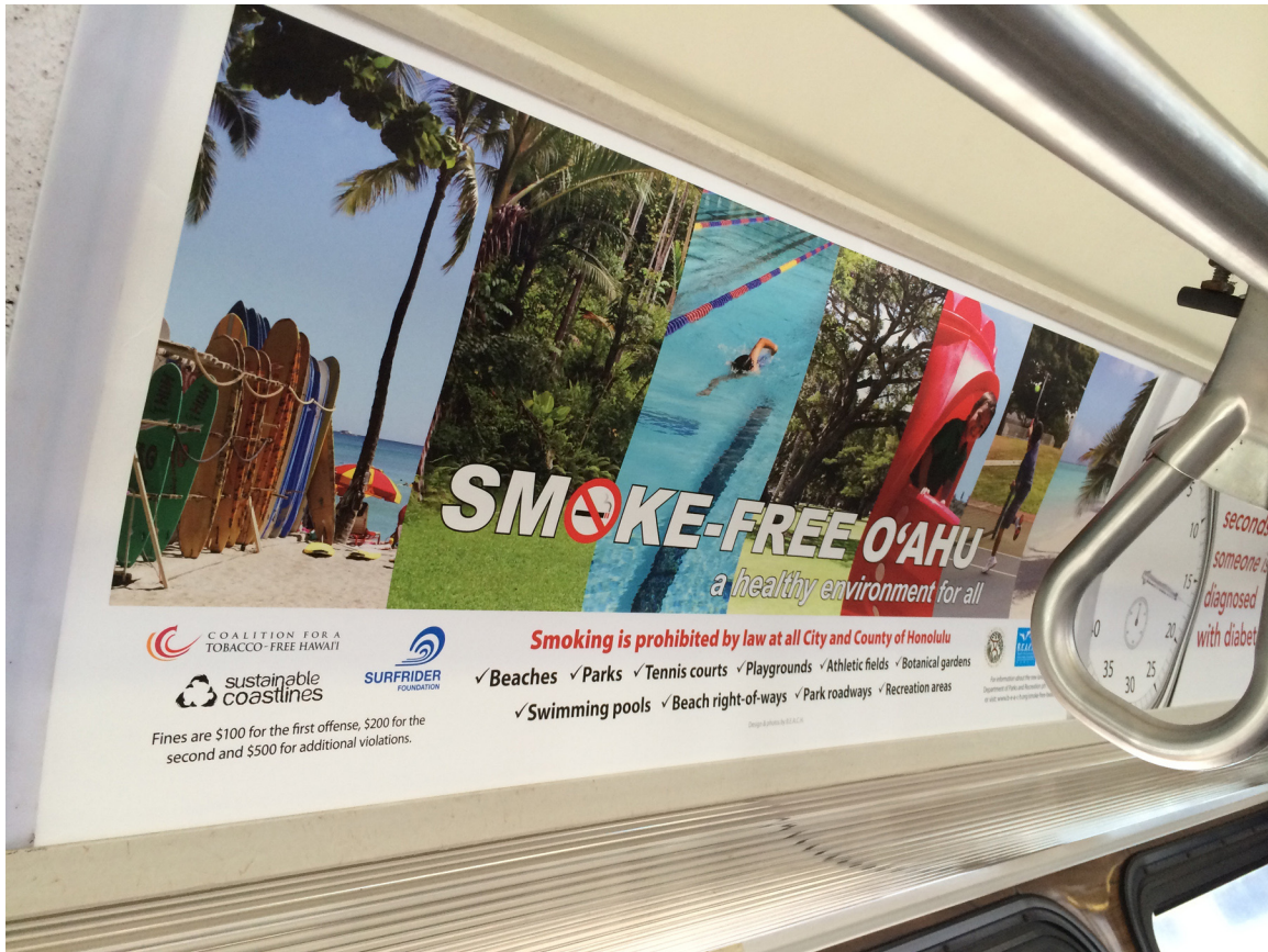
Smoke-free beaches and parks bus poster. Designed by B.E.A.C.H.