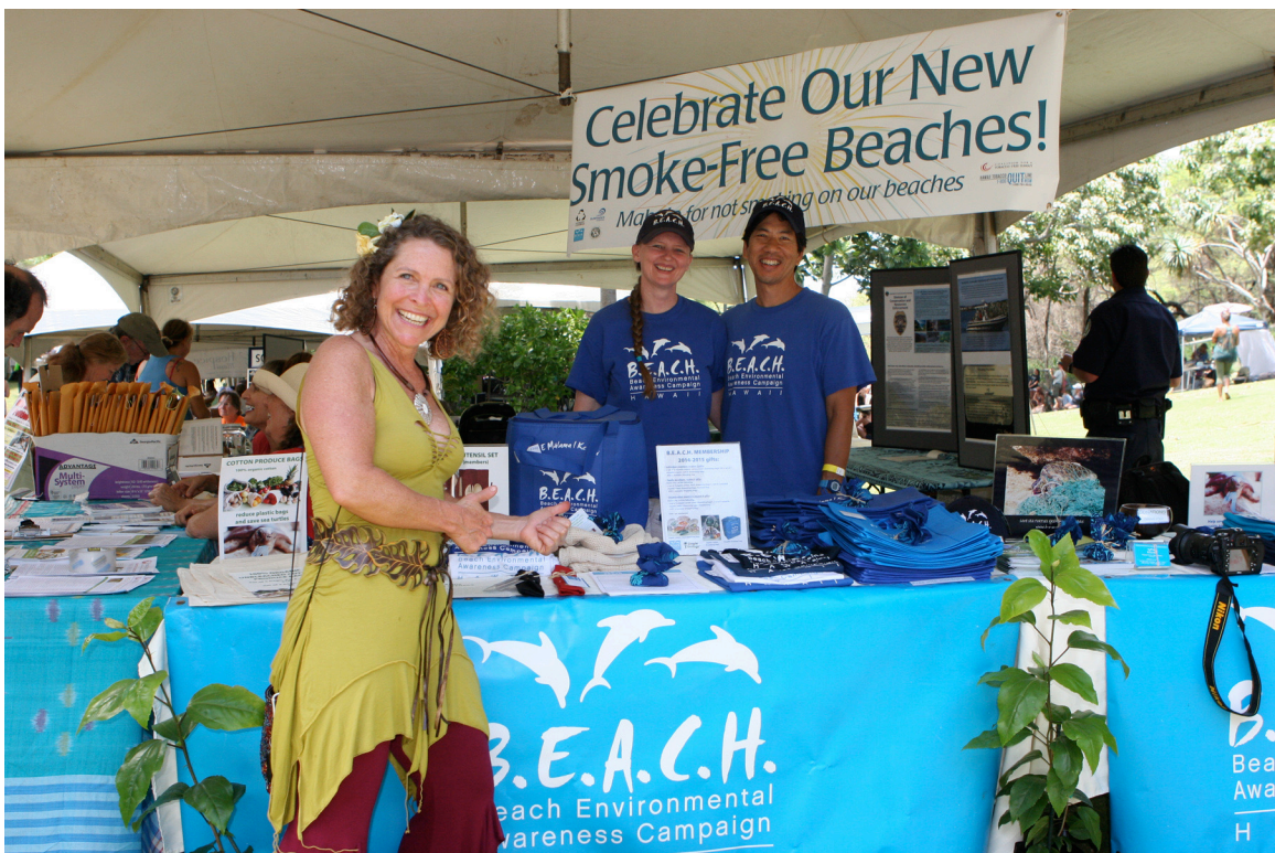
B.E.A.C.H. doing outreach at the Maui Earth Day Festival, April 2014 - educating the public about the new Maui County law banning tobacco at all beaches and parks.