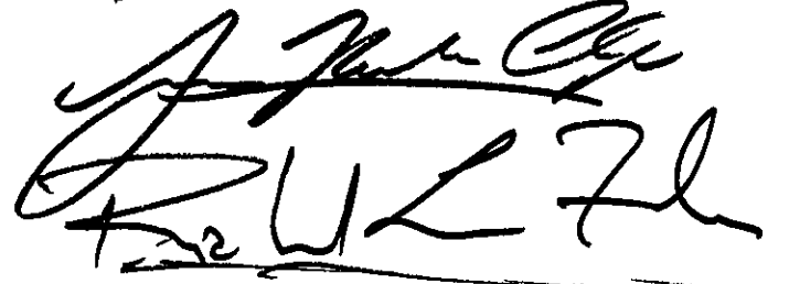
JAN 1 8 2013