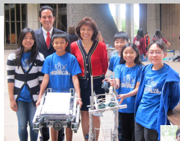
Left: Farrington HS 9th grade class; Right: Farrington HS Robotics