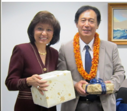
Below: Consul General Toyoei Shigeeda