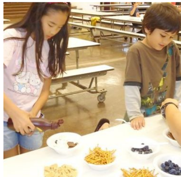
Lili'uokalani has a rich and illustrious history and students have a deep pride in their school.

The first-graders were thrilled to be photographed in the Governor's official Ceremonial Room and then posed in front of their school's namesake Queen Lili'uokalani.