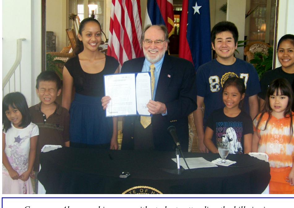
Governor Abercrombie poses with students attending the bill signing