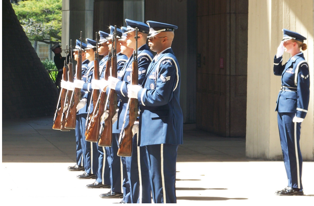
Observing a moment of silence following Taps and a 21 gun salute to honor fallen service members

Families and friends gathered at the State Capitol on March 29 to accept Hawaii State Medals of Honor (HMOH) on behalf of Hawaii's fallen service members. Created in 2005, Act 21 expresses the deep appreciation and gratitude Hawaii has for those who have sacrificed their lives in defense of our nation and freedom. The Senate and House of Representatives held a joint session to honor Hawaii's military heroes with a special ceremony. After names of military members were announced, they were rendered honors of two bells while family members were presented with a plaque and certificate. This year 17 medals were presented, bringing the total number of recipients to over 200.