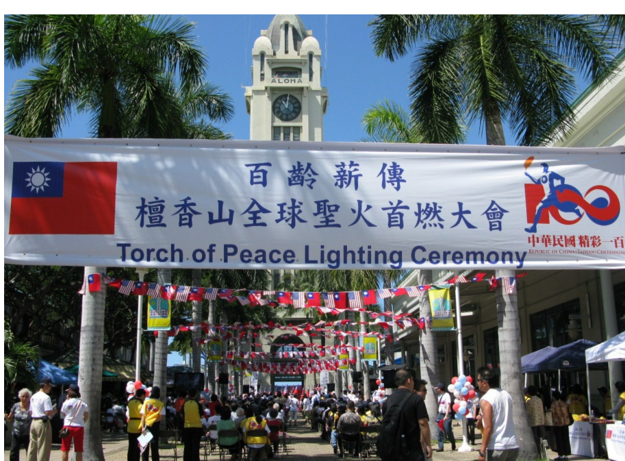
Torch of Peace lighting ceremony at Aloha Tower Market Place - March 1, 2011