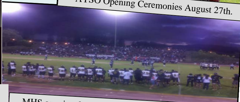
MHS opening football game against St. Louis August