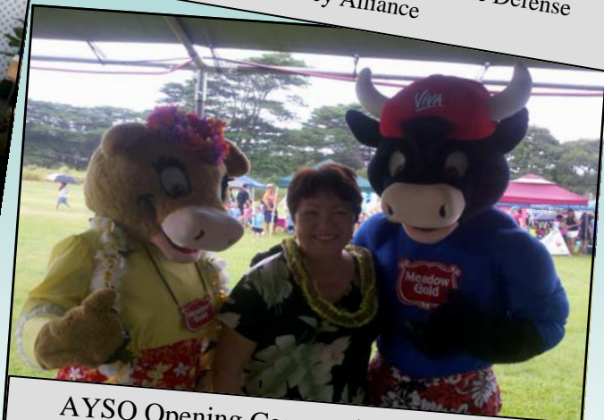
AYSO Opening Ceremonies August 27th.