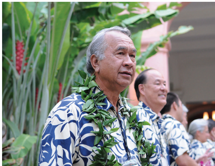
Senator Kahele greeting CSG-West legislators

The conference provided an excellent opportunity for our legislators to interact with fellow legislators who are also dealing with the difficulties of a strained economy and trying to provide needed support services in the face of shrinking budgets. Having open discussions about these key issues created new ideas for potential solutions and legislation for the