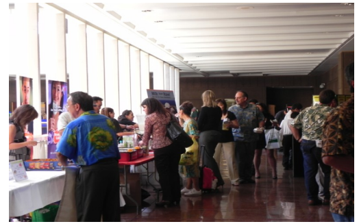
The Senate and House Committees on Agriculture, hosted Ag Day at the Hawai'i State Capitol on Wednesday, March 30.