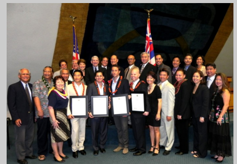
The Senators honored the cast and crew of the hit CBS series Hawaii Five-O.