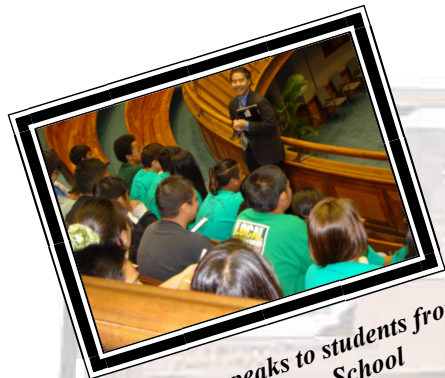
Sen. Ige speaks to students from Aiea Intermediate School