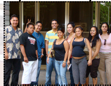
Students from Aiea Adult School visit the State Capitol