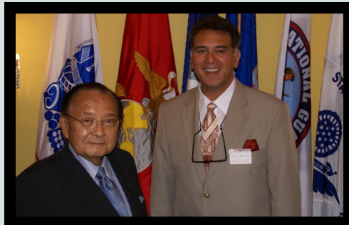
Senator Daniel Inouye

During my recent trip to Washington DC I was privileged to meet with both of Hawaii's distinguished US Senators. We discussed issues of importance to Hawaii and the 12th District.