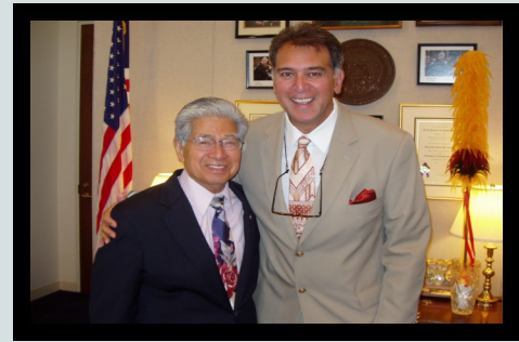
Senator Daniel Akaka

Don't forget, you can stay in touch with me using the following social media sites: