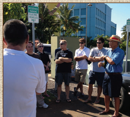
Senator Gabbard participated in the National Plug-In Day event in Kakaako on October 16 th to celebrate and encourage our state's transition to electric vehicles. Senator Gabbard has been a proud owner of a Nissan Leaf since April of this year.