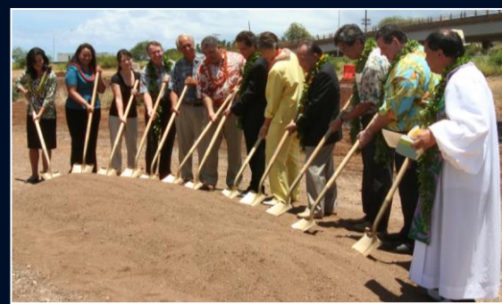
July 2, 2009 – Groundbreaking and blessing ceremony for the Kapolei Interchange.

What's really cool is that no state money is being used. Total construction cost will be $16.6 million, with $15.6 coming from the federal government and $1 million from Kapolei Property Development. The expected completion date will be early 2011 and the contractor is Hawaiian Dredging Construction Company.