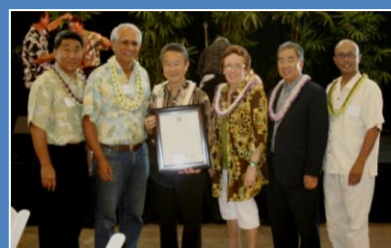
The Hawai'i Carpenters Union opened up a new training facility in Kalaeloa on May 23, 2009.