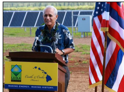
January 6, 2009 – Castle & Cooke's dedication ceremony for La Ola on Lana'i, the largest Solar Farm in Hawai'i.