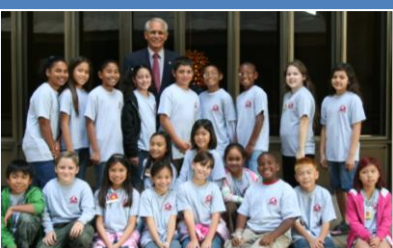
The Ohana Council from Mauka Lani Elementary visited the State Capitol on March 10, 2009.

to our congressional delegation and President Obama for their hard work in making this happen!