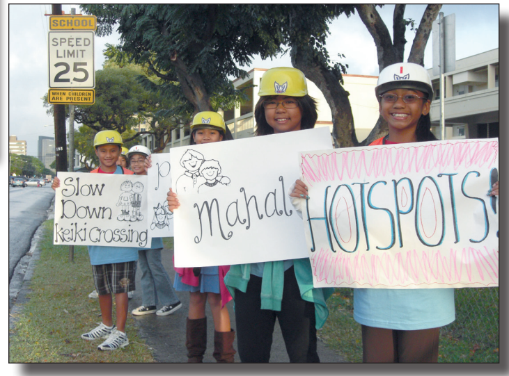
Kaahumanu students signhold to emphasize safety around their school.

develop a 'one-stop' telecom and broadband permitting process. Various state-county coalitions applying for federal broadband grants for health IT, public safety and public tech infrastructure will report back to the legislature before the 2011 session.