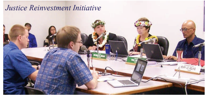
Justice Reinvestment Initiative