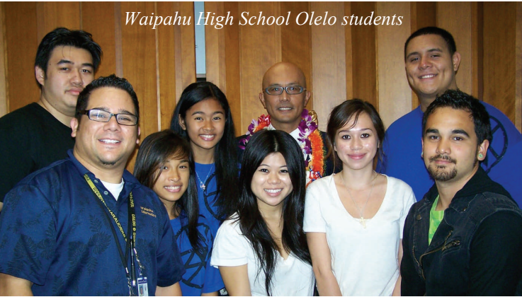
Waipahu High School Olelo students