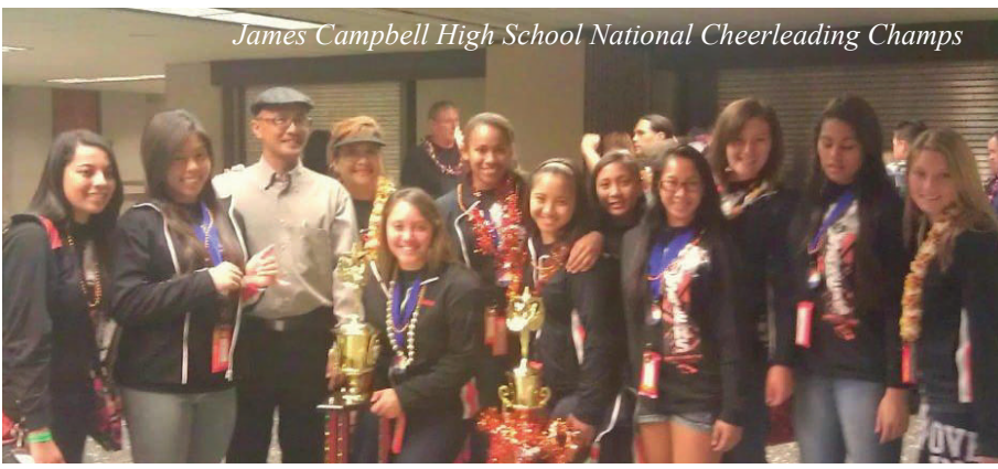
James Campbell High School National Cheerleading Champs