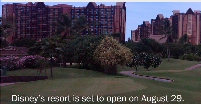
Disney's resort is set to open on August 29.