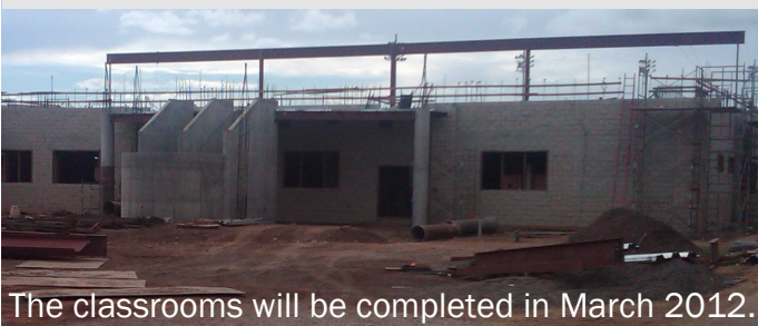
The classrooms will be completed in March 2012.