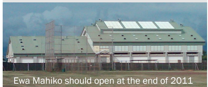
Ewa Mahiko should open at the end of 2011