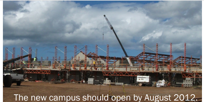
The new campus should open by August 2012.