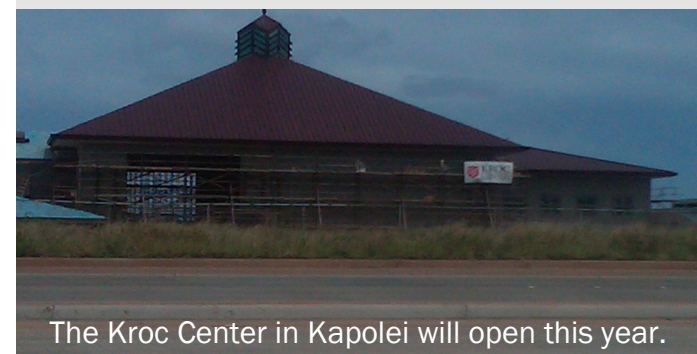
The Kroc Center in Kapolei will open this year.