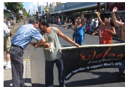
Sen English attended King Kamehameha Day Parade in Lahaina town. June 16, 2012.