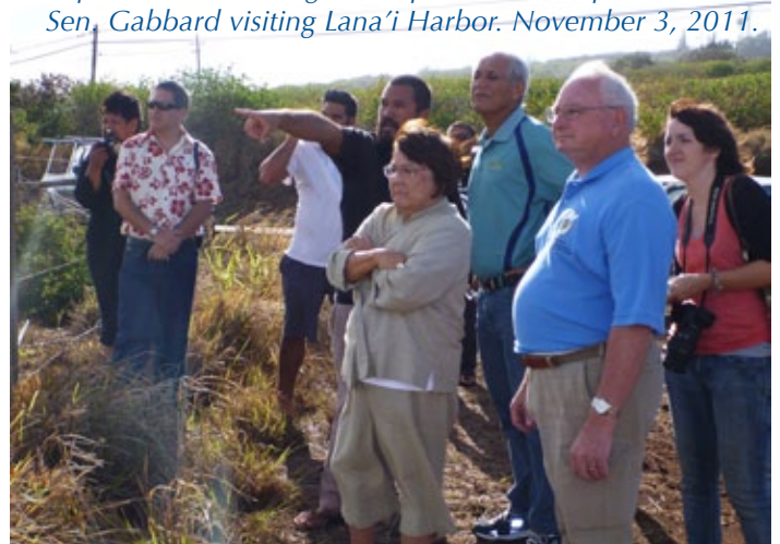
Moloka'i community representatives show Senate and House Energy Committee members proposed site for windmills in Westend Moloka'i. November 2, 2011.