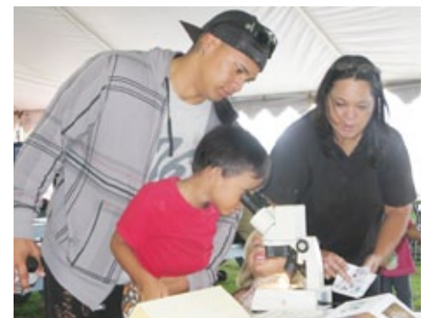
A family explores Limu at the 3rd Annual Limu Festival at Hana Bay, Nov. 5, 2011.