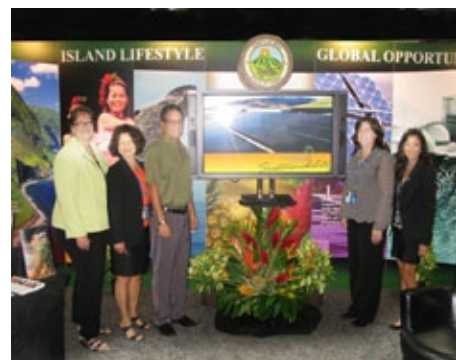
Sen. English visits officials of Maui County Economic Development Office booth at APEC in Honolulu. Nov. 7, 2011.