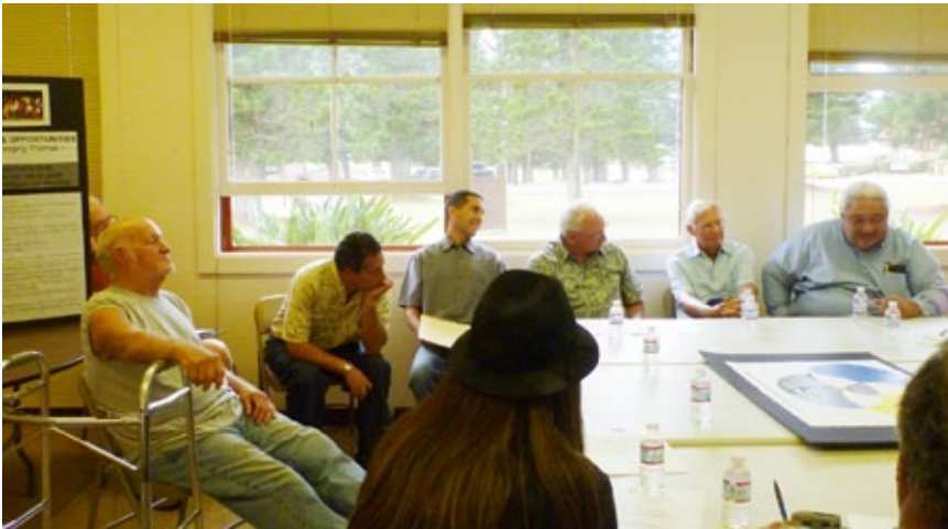
Listening visit with Lanaians for Sensible Growth at Queen Lili'uokalani Children's Center. November 3, 2011.