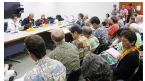
Joint info briefing of the Senate Energy and Consumer Protection Committees on the Lana'i and Moloka'i wind projects and interisland cable. Jan. 11, 2011