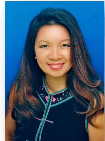
Susie Chun Oakland State Senator District 13

Proudly serving the following communities: