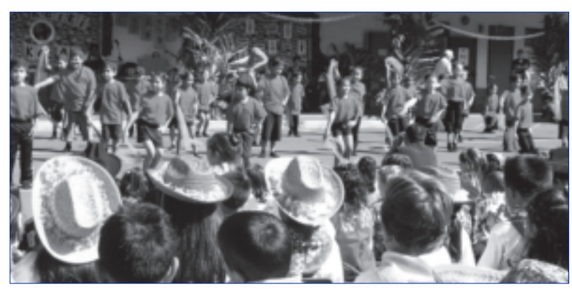
Watched the talented students at Pukalani Elementary School perform during the May Day program