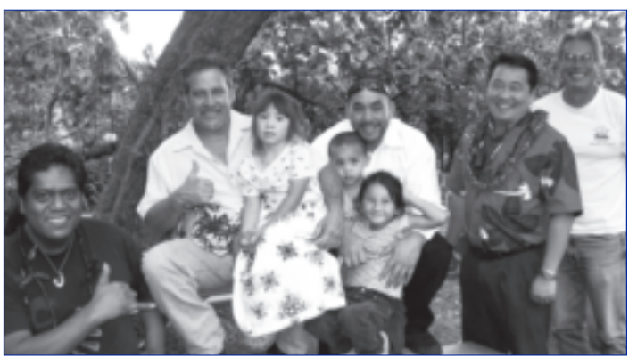
At Kula Hospital with employees and families during their May Day celebration.