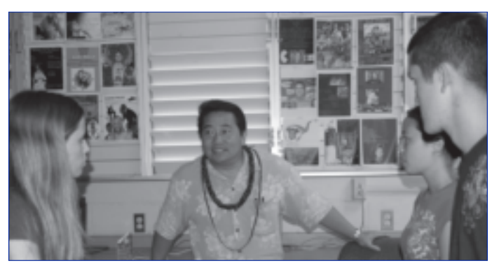
Visiting with Project East students at King Kekaulike High School.