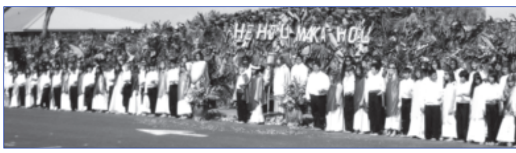
Kula Elementary School's May Day program shows the entire fifth grade class participating in the court.

These devices are often loaded with mercury and other potentially harmful substances and impact our limited landfill space.