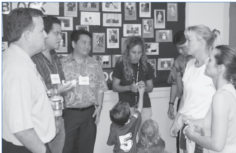
Together with Senators and concerned parents of Makawao Elementary School.