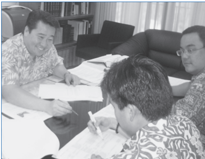
Meeting with colleagues.

This information was provided by the State Department of Health, Environmental Health Branch.