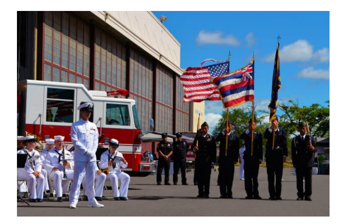
James Campbell High School Navy JROTC Color Guard during the 9/11 Remembrance Ceremony Centennial of Naval Aviation Open House