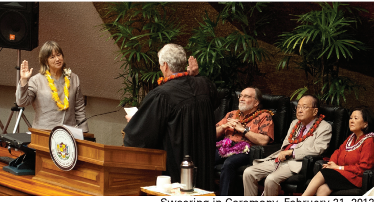
Swearing in Ceremony, February 21, 2012