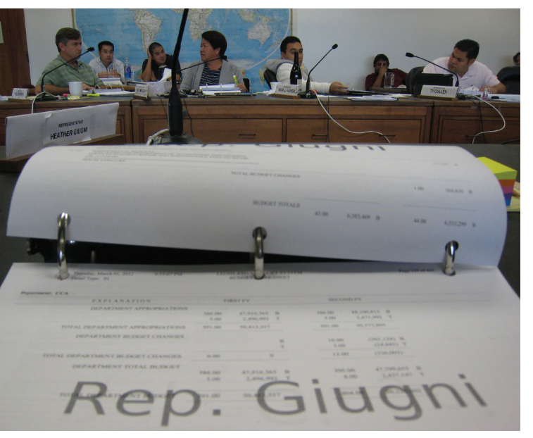
Finance Committee Meeting