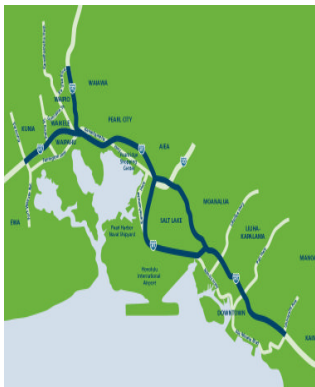
FSP coverage area

Freeway Service Patrol offers a variety of services to assist you when your vehicle has stopped on the freeway. The goal of FSP is to help you get your vehicle started so that you can get back on the road. If your vehicle does not start, a Freeway Service Patrol driver may tow you and your vehicle to an off-freeway location or to the side of the freeway, out of the lanes of traffic. The Freeway Service Patrol is available from 5 a.m. to 7 p.m. Monday through Friday, excluding some holidays. The services provided include: