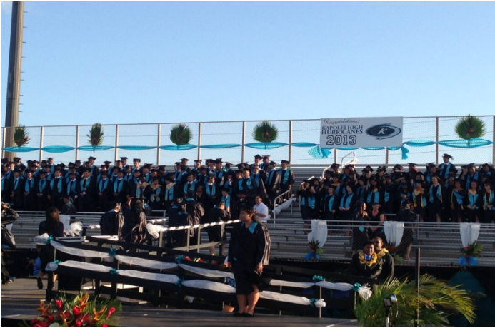
Kapolei High School Graduation May 17, 2013

Spring brings May Day celebrations and Graduation Ceremonies to Hawaii. I enjoyed several of these events around our community in the month of May.