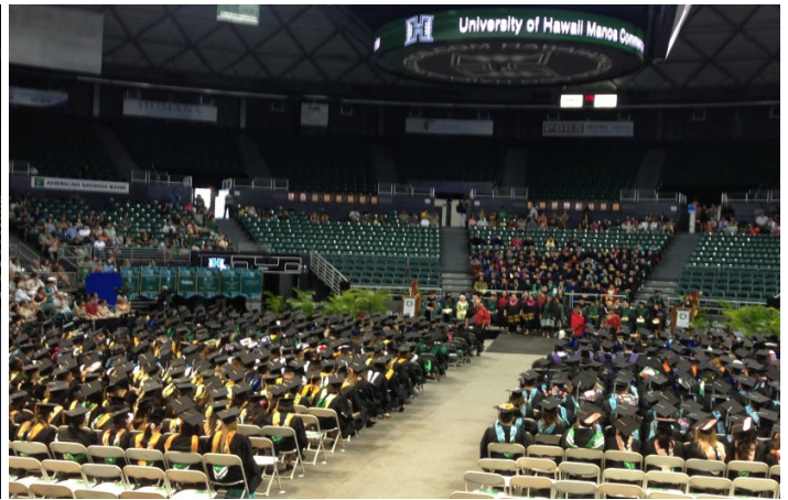
UH Manoa Graduation May 11 & UH West Oahu May 4