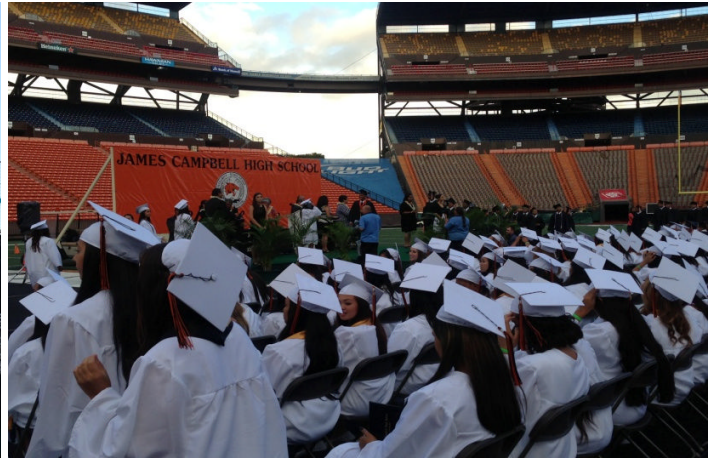
James Campbell High School Graduation May 19, 2013