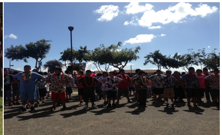
Kaleiopu'u May Day May 3, 2013