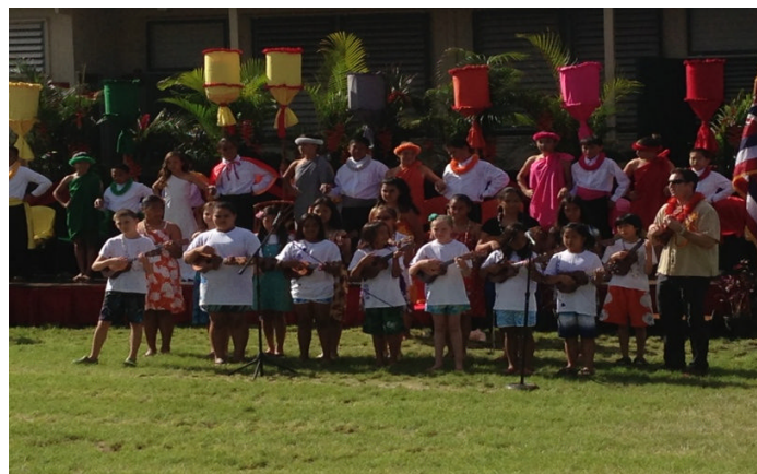
Mauka Lani May Day Celebration May 15, 2013