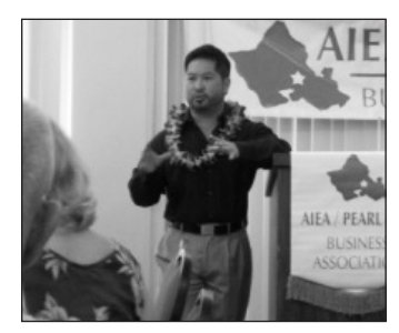
Meeting with the APCBA to discuss economic challenges facing our state and the legislative process in general.

The old Kam Drive-In site, currently home of the Kam swap meet, is being considered for redevelopment by the Robertson Properties Group (Los Angeles, CA). The proposed project will include residential and commercial components. My office will continue to keep surrounding residents apprised of the project as information becomes available. Consider reviewing minutes from the May 10 Aiea Neighborhood Board meeting when the developer heard concerns from our community.