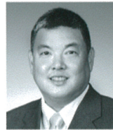
K. Mark Takai