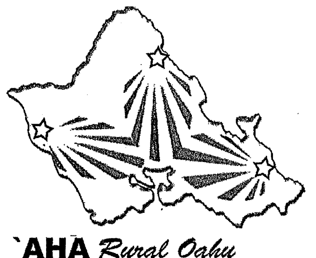
Accountable Healthcare Alliance of Rural Oahu