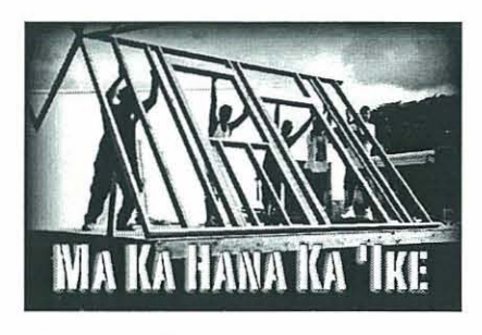
"In Working, One Learns"