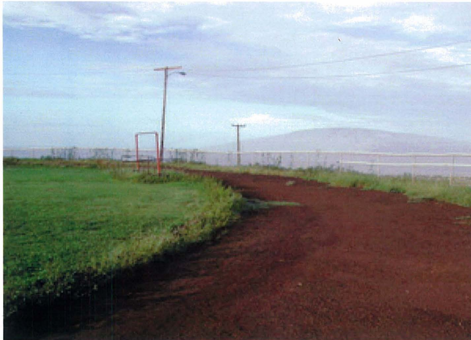
Lahainaluna Athletic Field -- February 2010