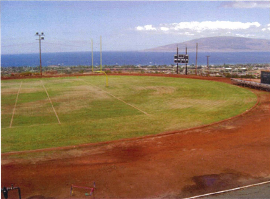
Lahainaluna Athletic Field - February 2010