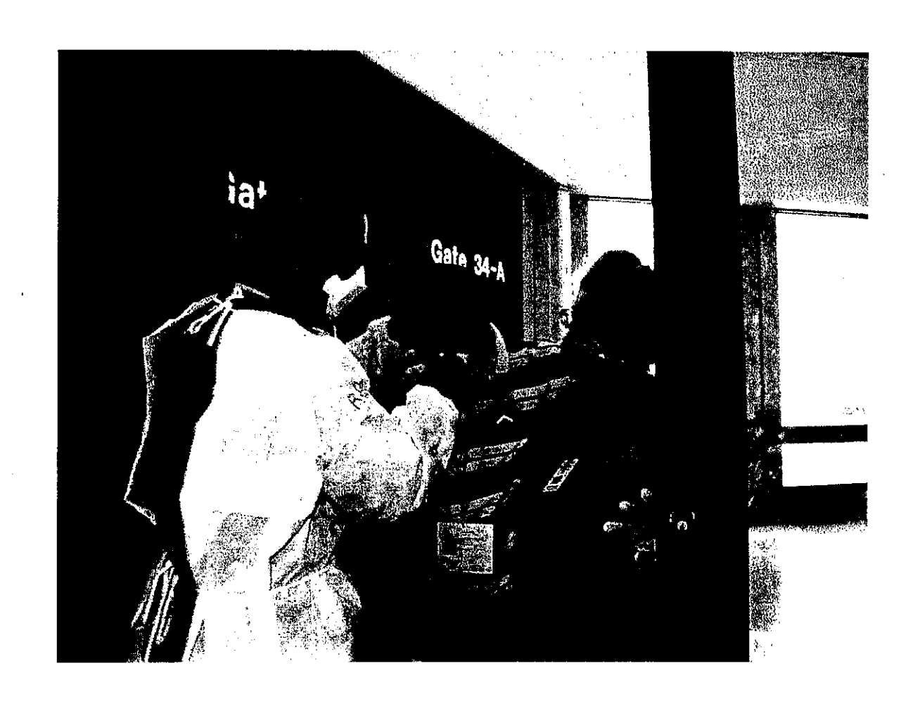
Volunteers participate in Operation Lightning Rescue at Honolulu International Airport.