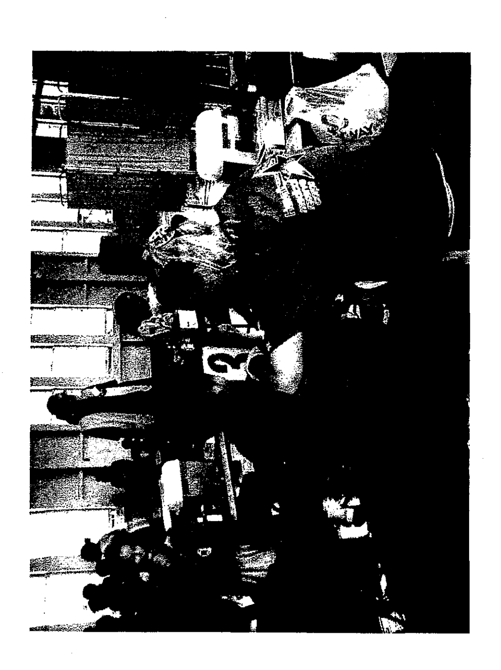
Volunteers work with the Dept of Health to vaccinate Hawaii's school children for influenza.