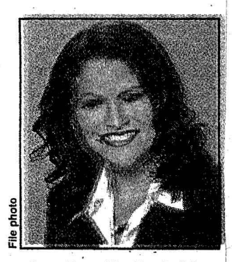
State Rep. Kymberly Pine

I love our country and I have deep appreciation for those who serve her. I applaud and respect the men and women who choose to dedicate their lives in order to protect ours. I revere our nation's symbols of