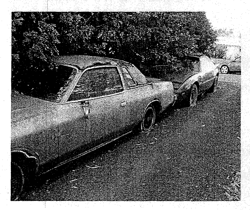
I have to live next to this bringing my property value down with no way to change it