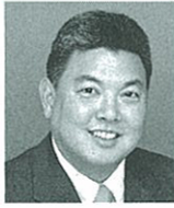
K. Mark Takai