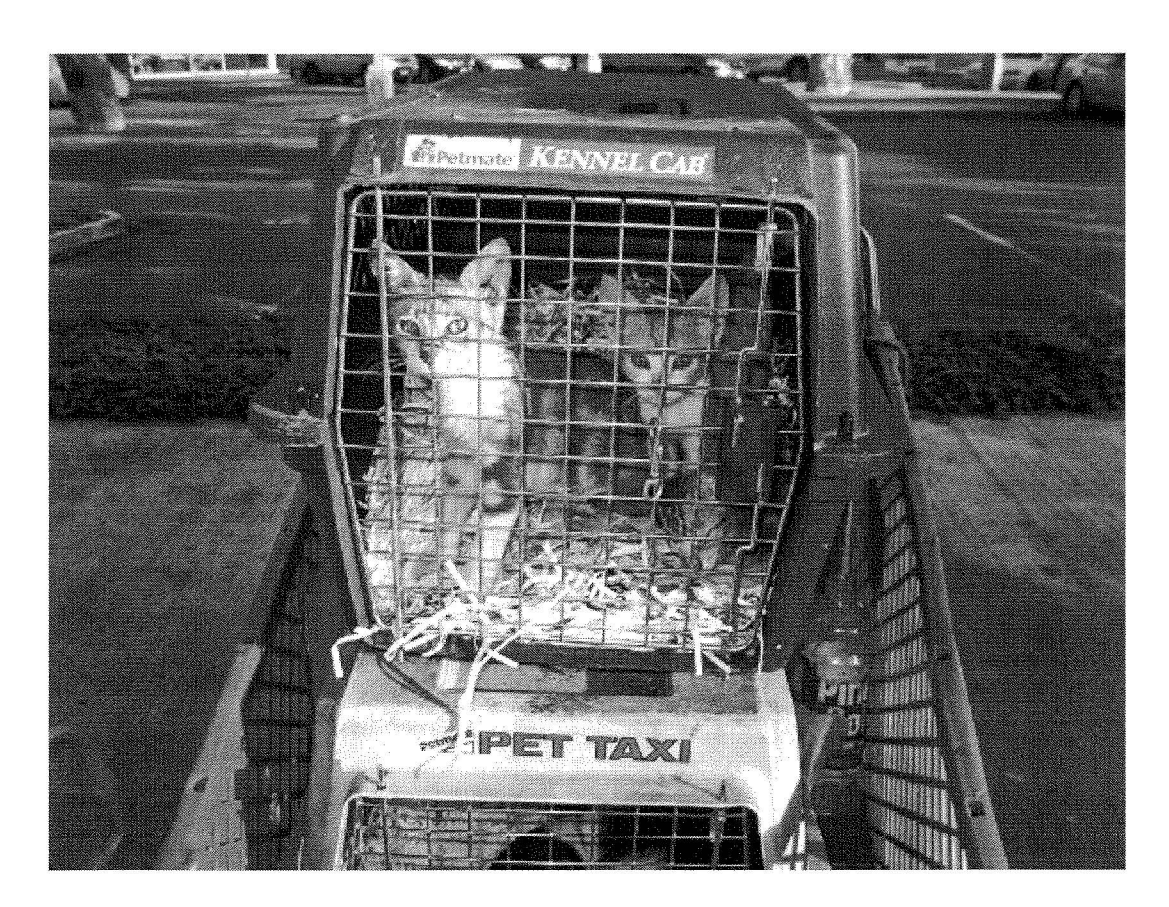
Pet carriers stacked in shopping carts. Honolulu, October 2007