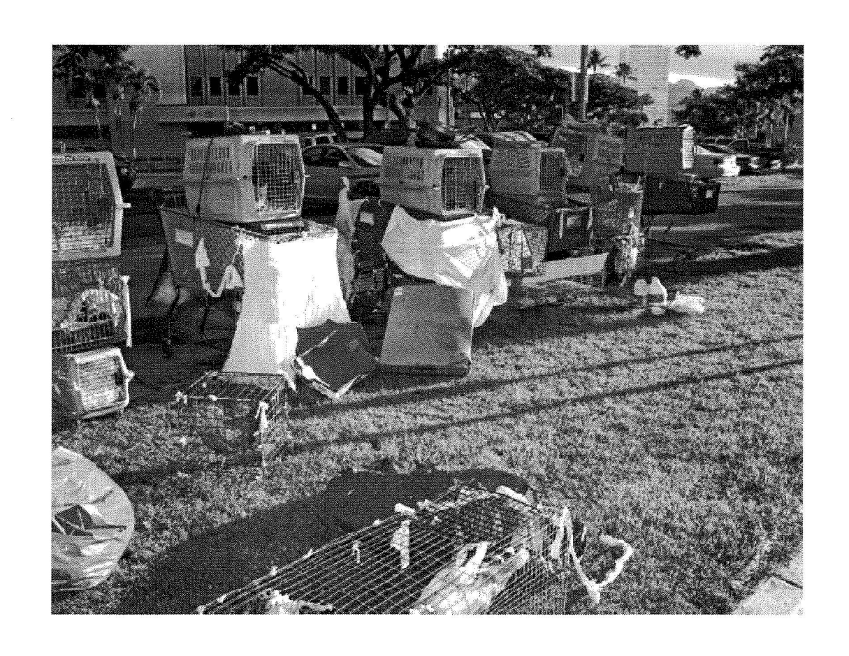
Animal hoarder's carts and carriers. Honolulu, October 2007