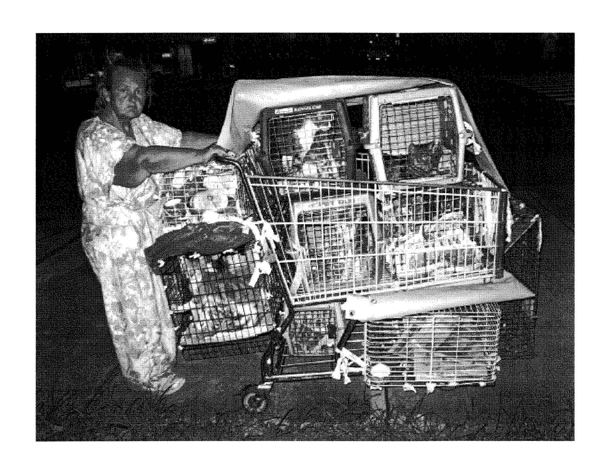
Animal hoarder with shopping cart. Honolulu, December 2007