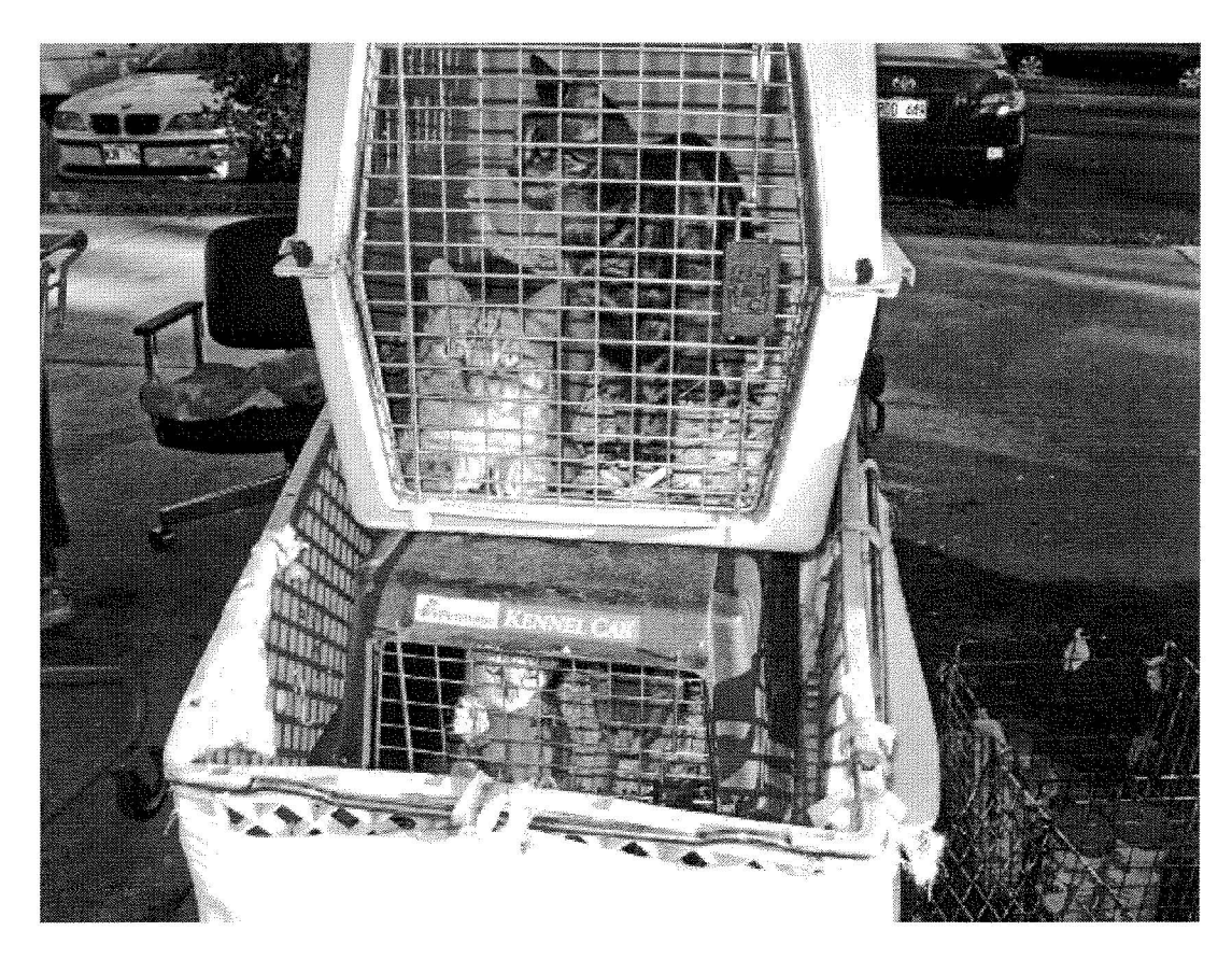
Pet carriers stacked in shopping carts. Honolulu, October 2007