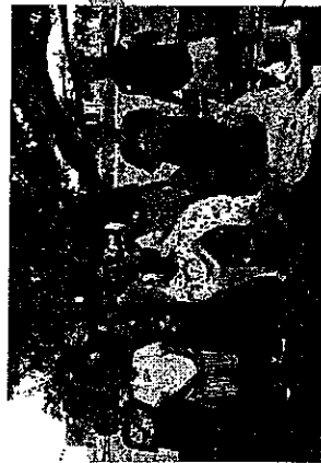
Painting for Kauai Humane Society.