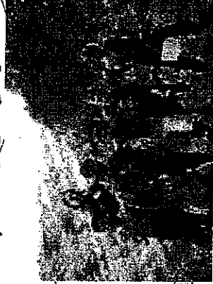
Hiking up Sleeping Giant Mountain.

Sponsored by: Kana'i Economic Opportunity, Incorporated; Kapa'a Middle School; Chiefess Kamakahalei Middle School; Waimea Canyon Middle School; Hawai'i State Department of Health; Alcohol & Drug Abuse Division