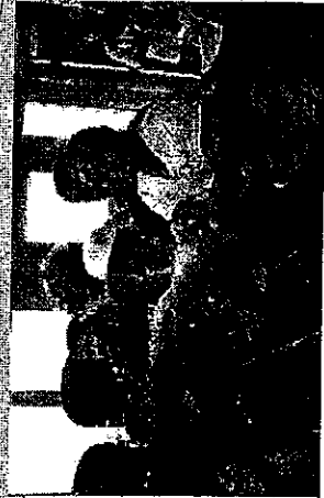
Kilauea Lighthouse Wildlife Refuge.

Kauai Economic Opportunity, Incorporated 2804 Wehe Road Lihue, Kauai, Hawaii 96766 Phone: 808-245-4077 Fax: 808-245-7476 Email: keo@keoinc.org