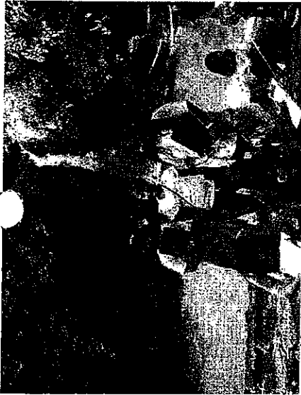
National Tropical Botanical Gardens