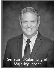
Senator J. Kalani English Majority Leader

The Senate is committed to building a more resilient future for our islands by advancing statewide policy changes and encouraging sustainable partnerships between the public and private sectors. The effects of climate change are upon us now. Together, we can face this uncertain future through the implementation of the 17 United Nations Sustainable Development Goals.